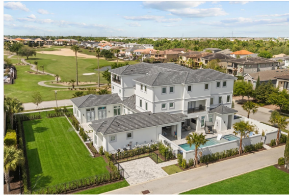
02 Whitemarsh Way – golf-front estate, aerial