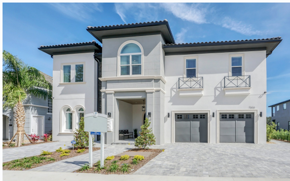
04 Excitement Drive – white & stone elevation