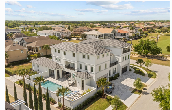
06 Whitemarsh Cove – estate & fairway