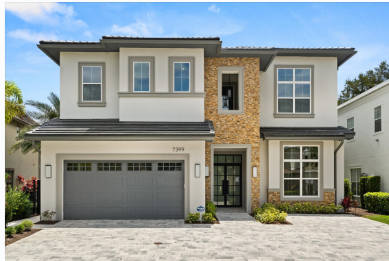
05 Midway Modern – contemporary elevation