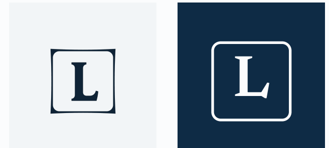
THE COURTYARD MARK · LIGHT & REVERSED · CLEAR SPACE = ½ MARK

JetBrains Mono carries codes, coordinates & schedules — LPD-SPEC-2026-R1