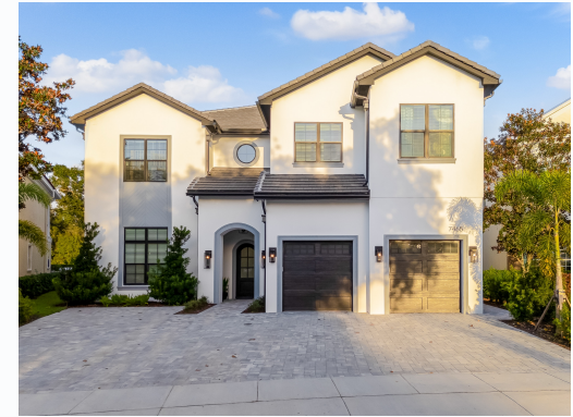
03 Gathering Loop – elevation by day