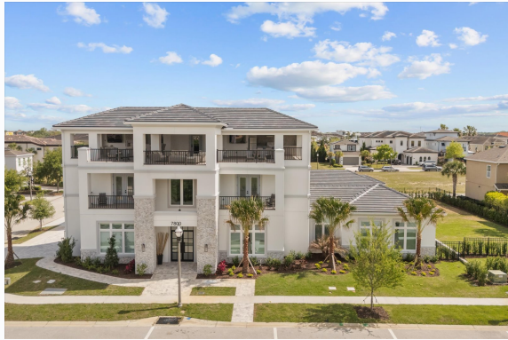
01 Whitemarsh Cove – front elevation